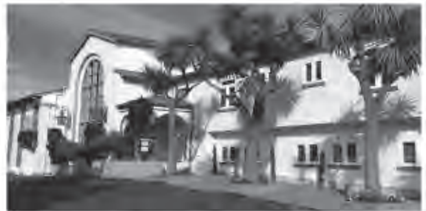
500 Westlake Ave, Daly City FD1098 duggans-serra.com