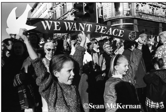
Peace Protest Belfast.