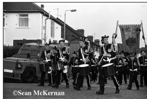
Orange Order Parade passes Peacewall Belfast.

Artist Talk: Sunday June 25, 2023 at 2 pm