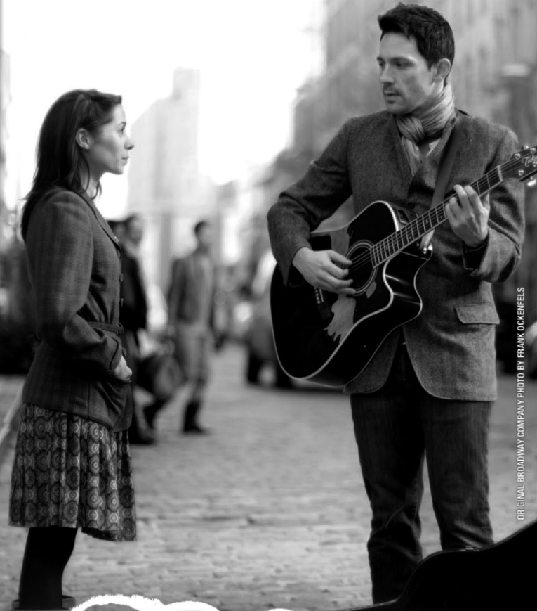
ORIGINAL BROADWAY COMPANY